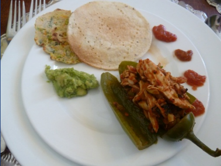
Tortillas are found in many dishes

Depending on the region you are in, you will find different types of food all over Mexico. Here are just a few delicious samples!