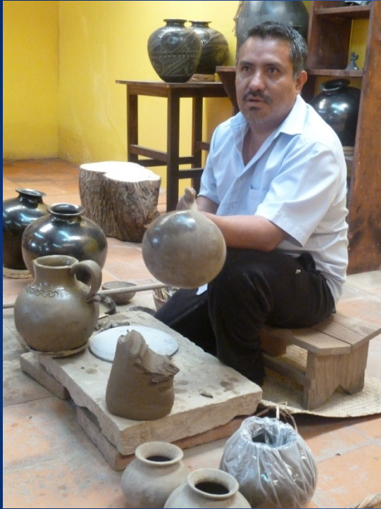
Black Pottery in Teotitlán de Valle, Oaxaca