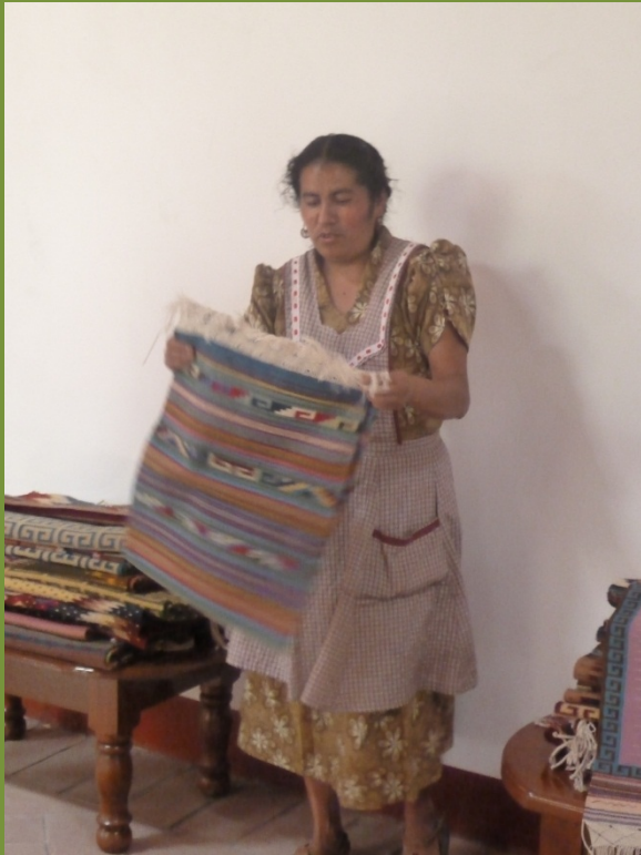
Zapotec Woven Rugs