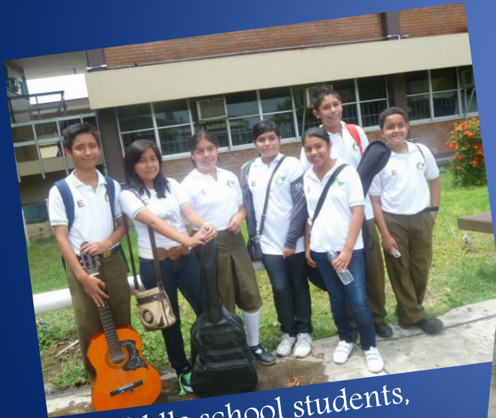
Middle school students, Veracruz

Mexico has many different groups of people! Indigenous groups, or people that are from a particular area, often have their own language and special cultural activities.