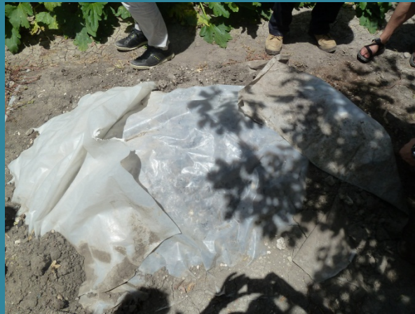
Hot compost helps to nourish their crops