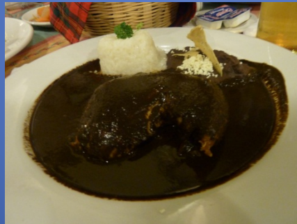
Mole negro from Oaxaca