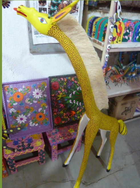
Alebrijes (carved wooden animals)