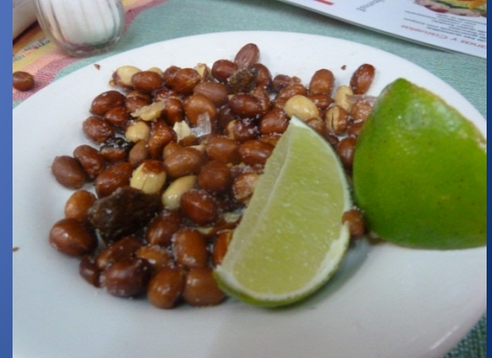
A snack of peanuts with lime