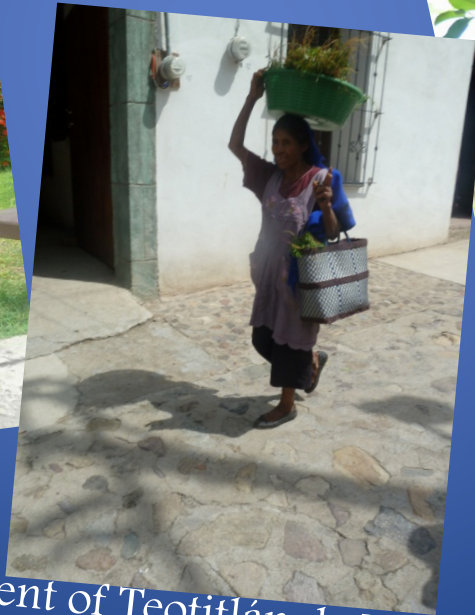
Resident of Teotitlán de Valle, Oaxaca