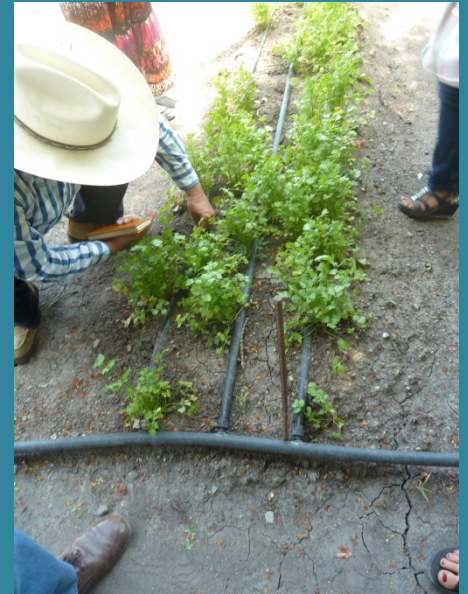
Picking fresh cilantro.