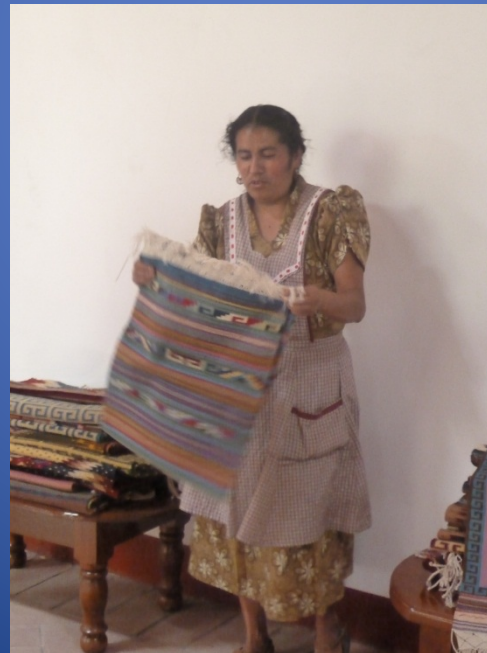
Zapotec rug, Teotitlán de Valle, Oaxaca