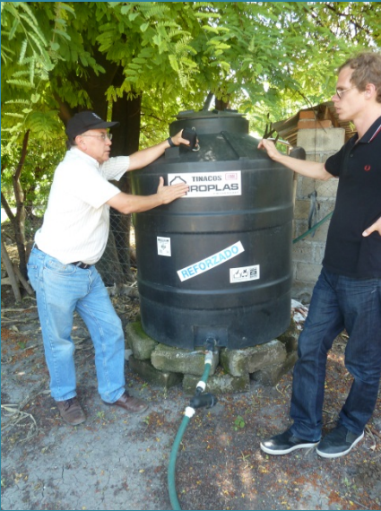
Rainwater collection tank used for watering their crops