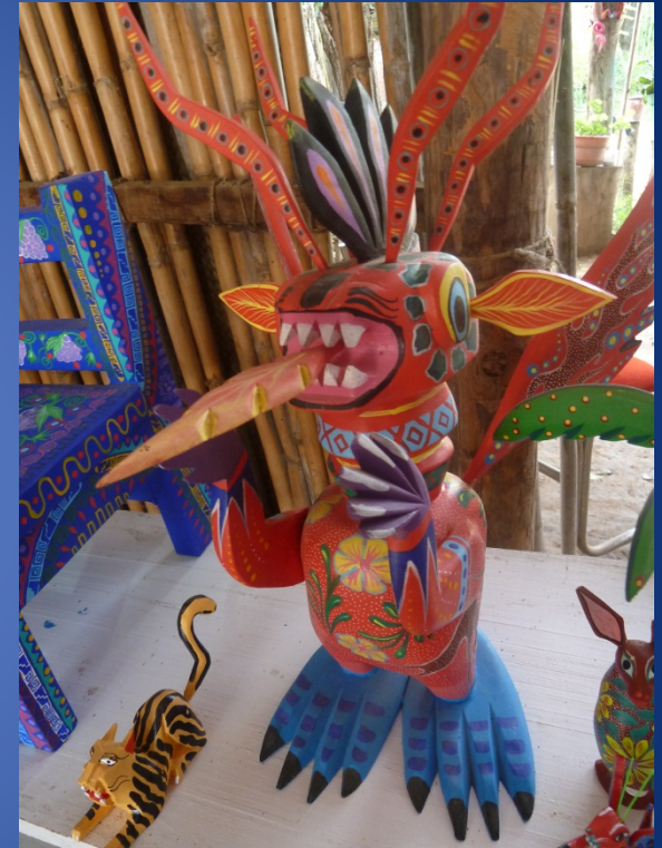
Alebrije , Tilcajete Village, Oaxaca